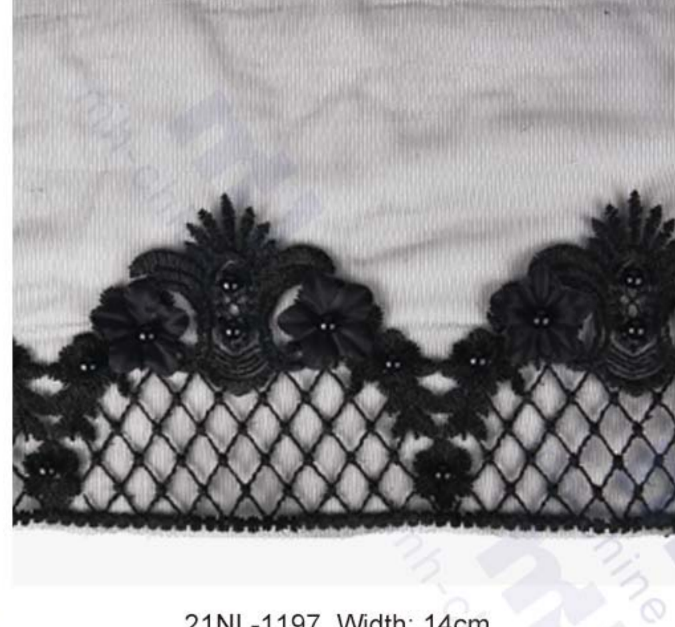
21NL-1197, Width: 14cm