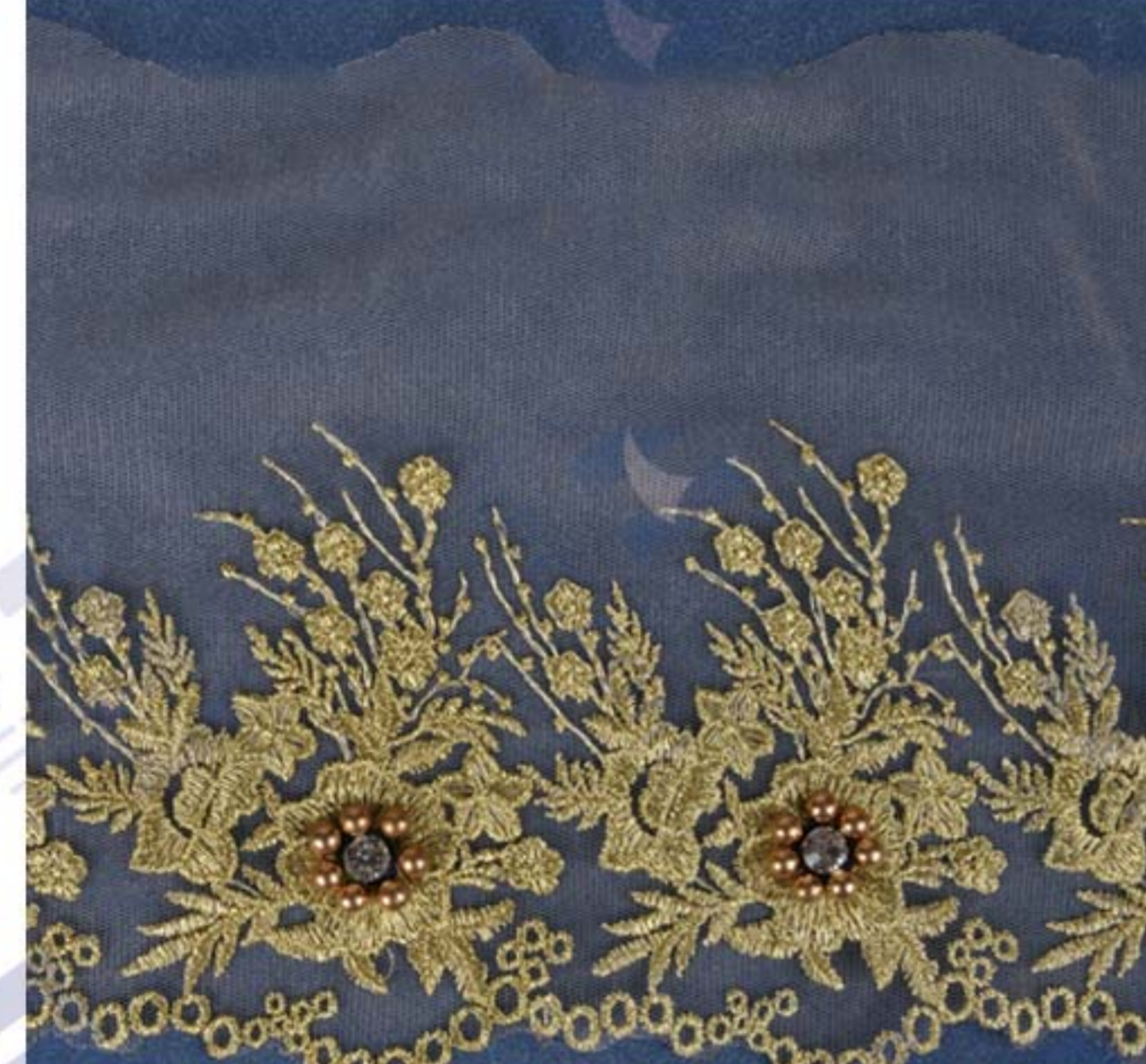
21NL-1159, Width: 17cm