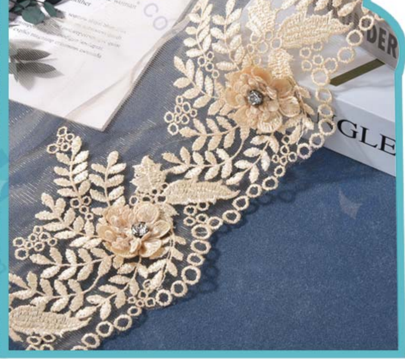
21NL-1158, Width: 19cm