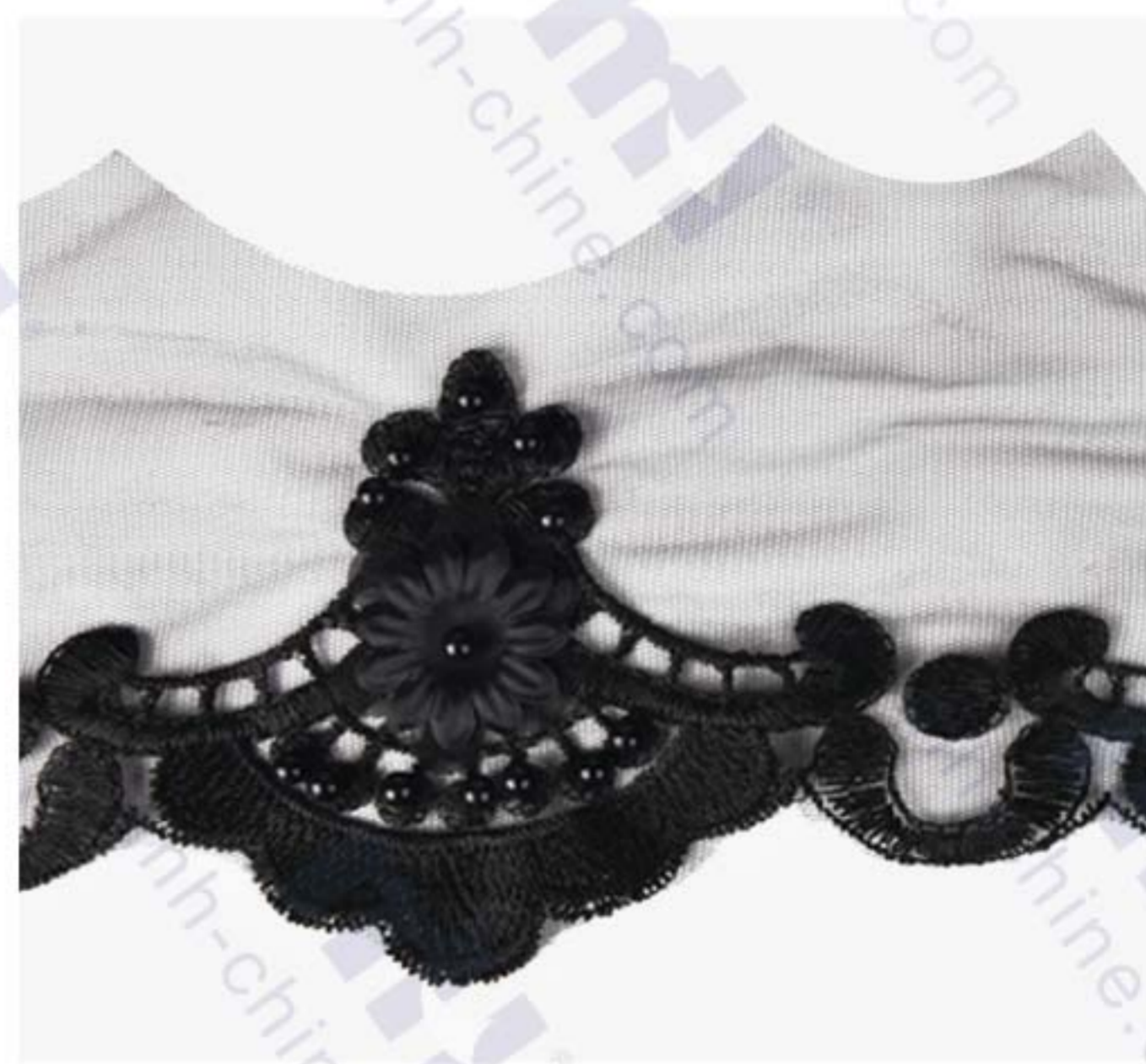
21NL-1214, Width: 15cm