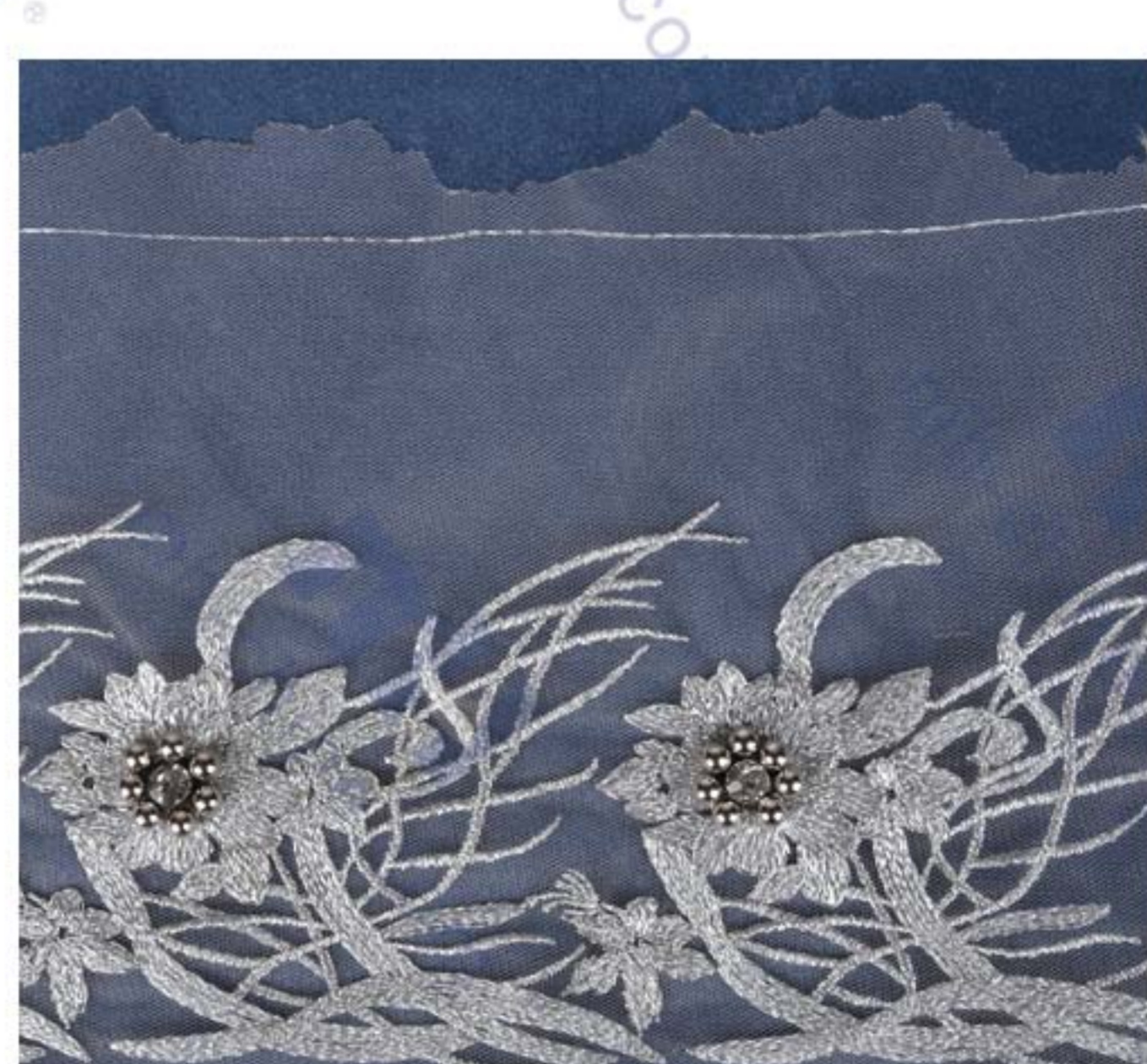
21NL-1163, Width: 17cm