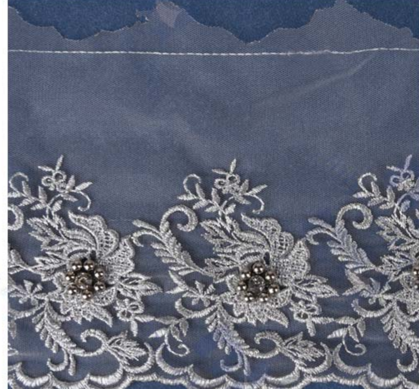
21NL-1161, Width: 17cm