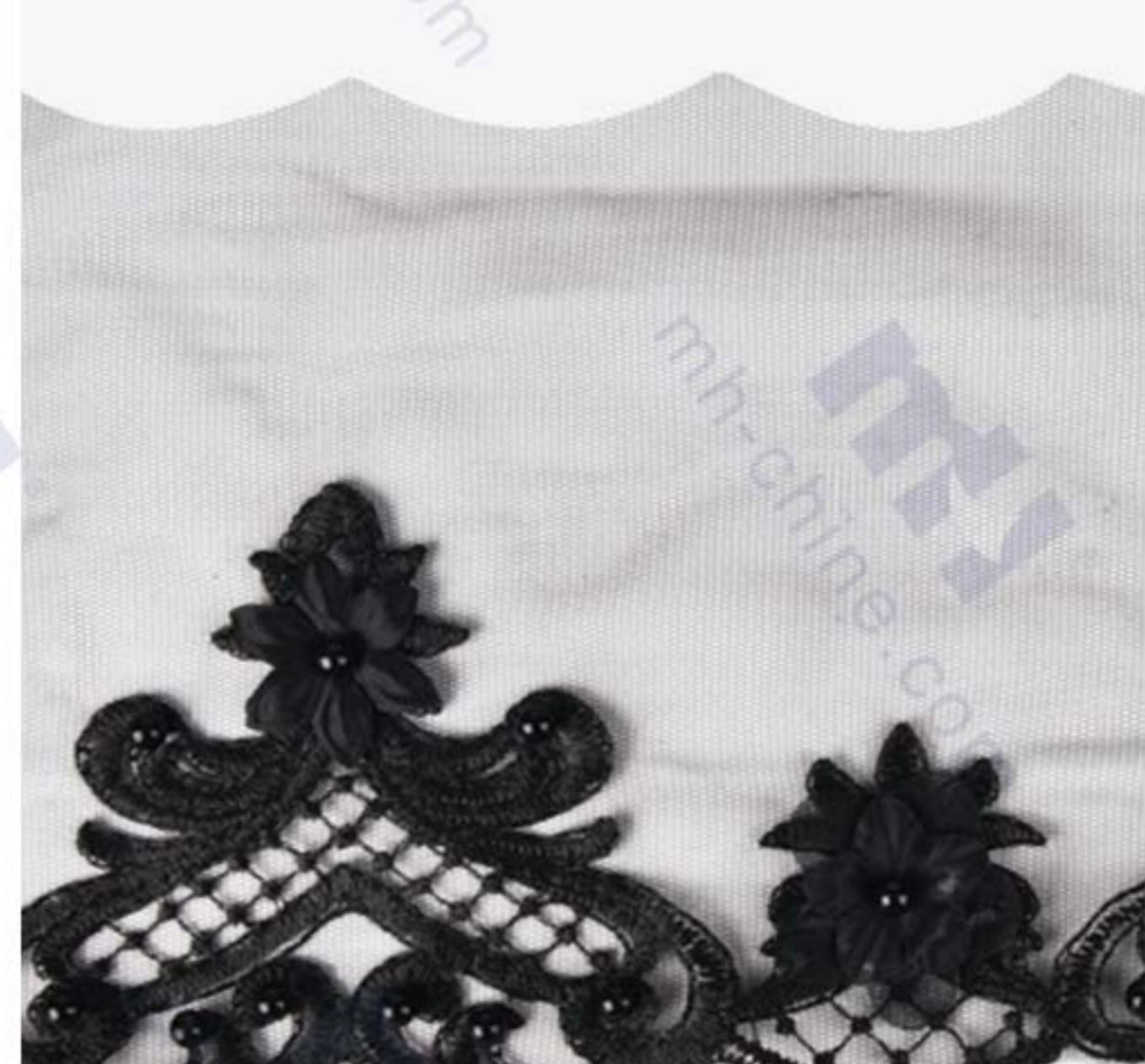
21NL-1190, Width: 18cm