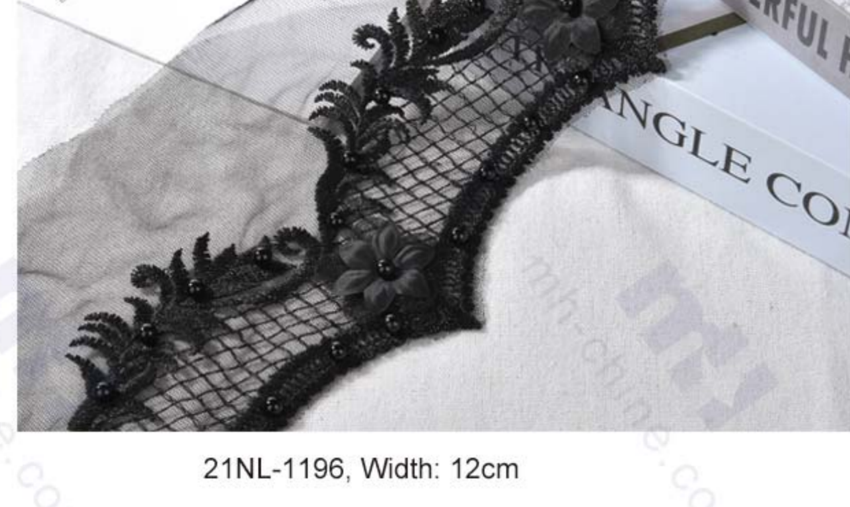
21NL-1196, Width: 12cm