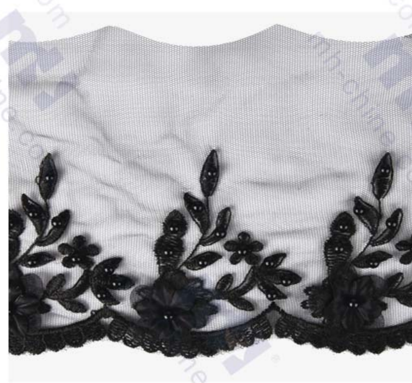
21NL-1224, Width: 16cm