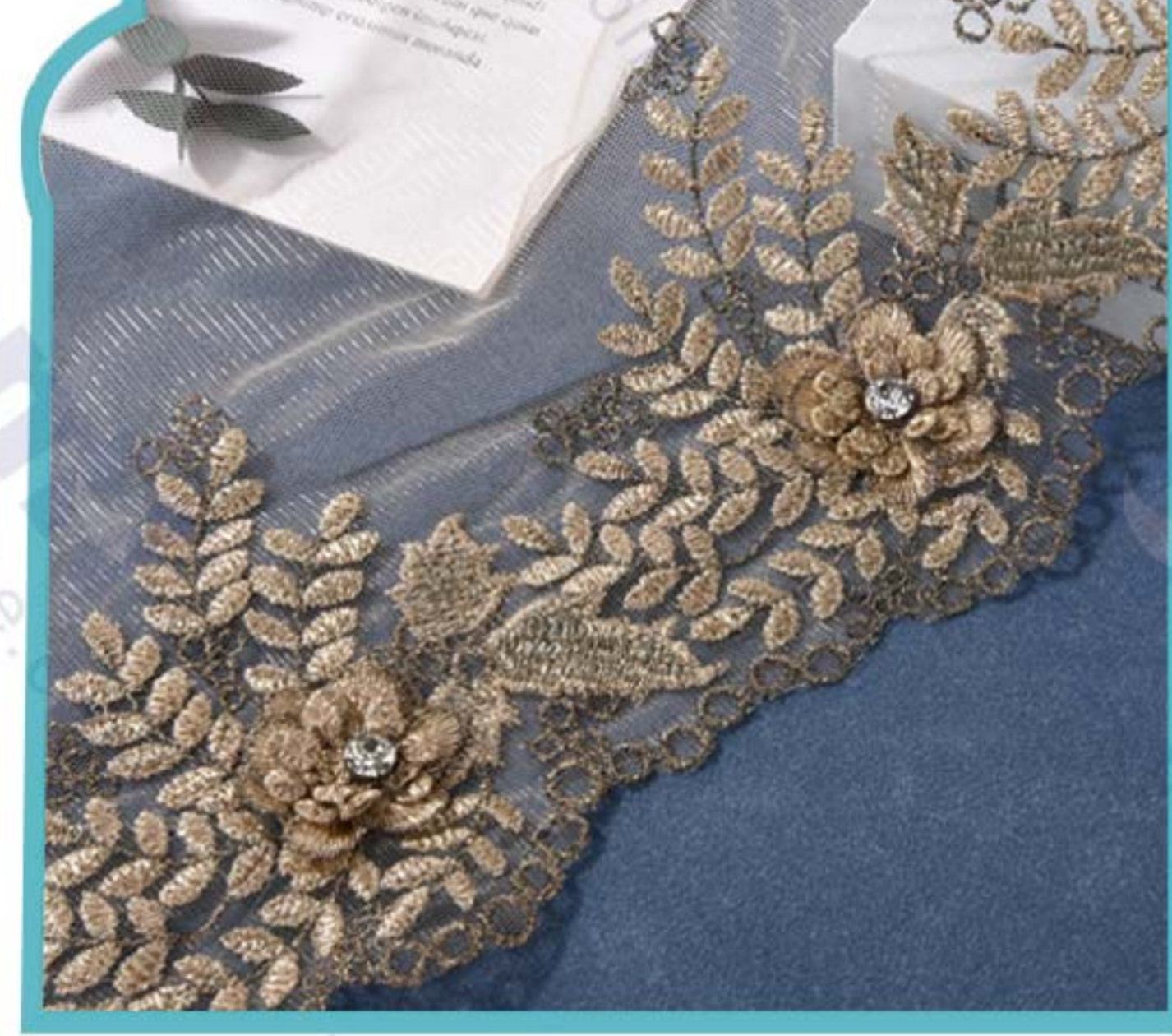
21NL-1158, Width: 19cm