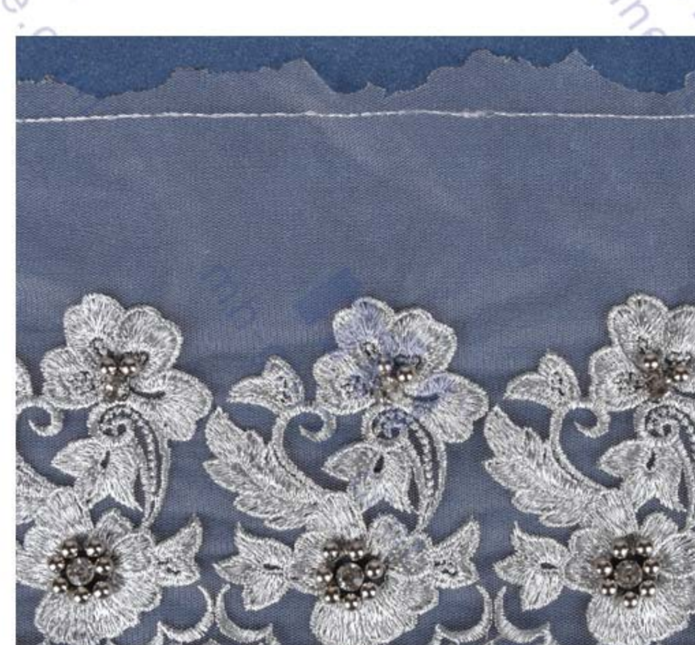
21NL-1162, Width: 17cm