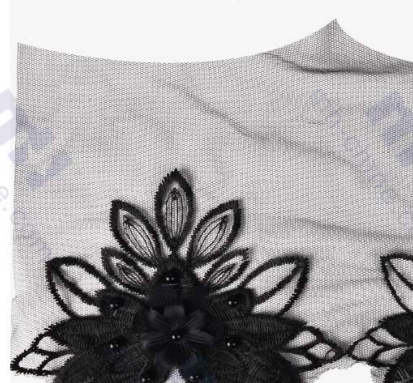
21NL-1187, Width: 17cm